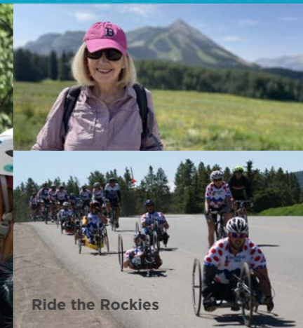
Ride the Rockies