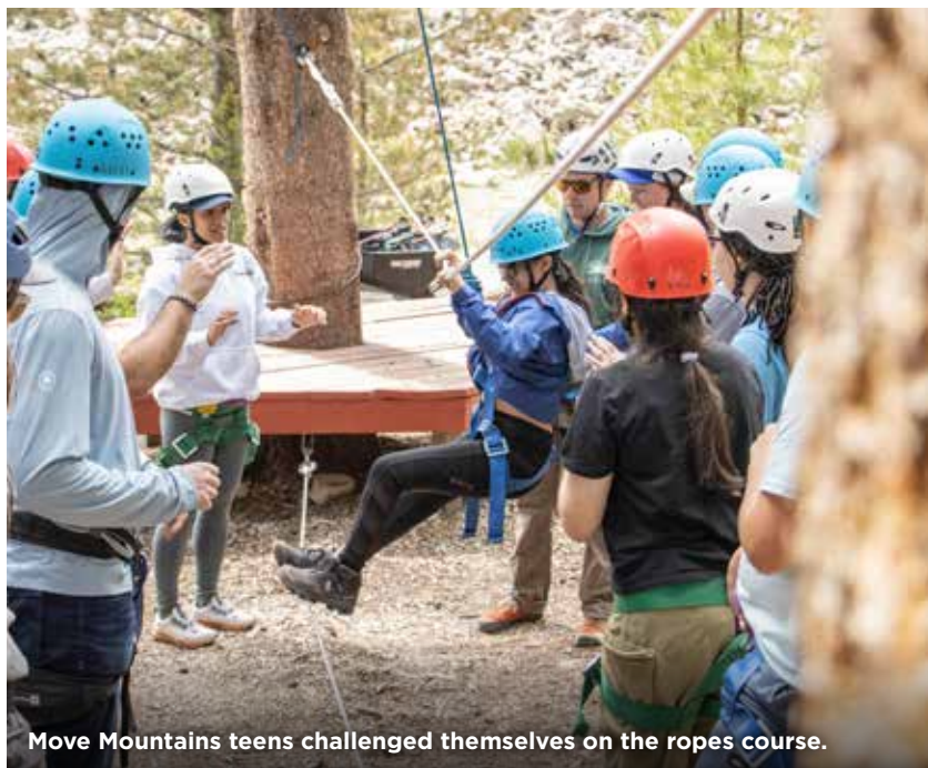
Move Mountains teens challenged themselves on the ropes course.