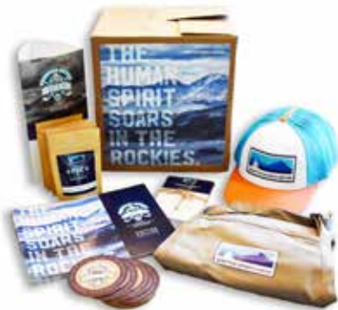
Example of 2020 Watch Party Box. Contents to be determined for 2021.

For a virtual event, each Watch Party Box includes a catered dinner for up to eight people, delivered to attendees residing in the Crested Butte-Gunnison area. For attendees outside of this area, you'll receive recipe cards to help you cook a delicious meal for your group to enjoy, a cocktail recipe card and other essentials for your gathering.